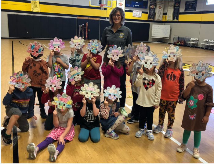
(Top) Salem Lutheran students getting in the Thanksgiving spirit.

5025 Lakewood Avenue St. Louis, MO. 63123 314-353-9242 - www.slcas.org