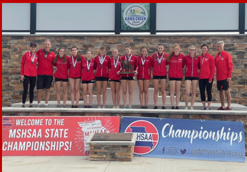
Congrats to the Charger Cross Country team for earning 4th place at STATE!