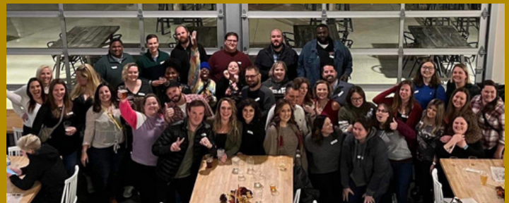
Affton HS Class of 2022 celebrates their 20 year reunion at the Canteen.