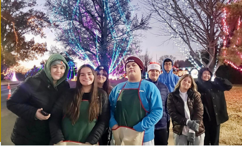
The Bayless High School student council worked the holiday lights at the Tilles Park Winter Wonderland this month.