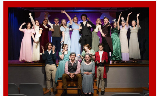
BRAVO! Cor Jesu's Fall Play, "Pride and Prejudice" was a great success!

On Saturday, November 12, Cor Jesu students, faculty, staff and parents visited service sites all over the city to Share the Love of the Heart of Christ in our community.