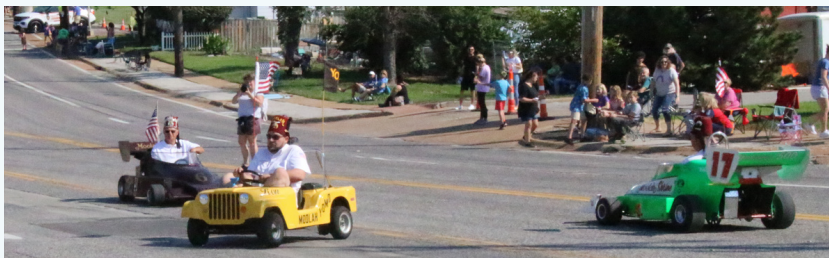
Most Original Entry: Moolah Shrine Gateway 500