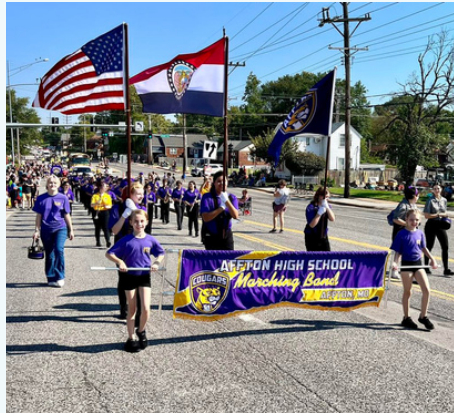
Best School Entry: Affton High School Band