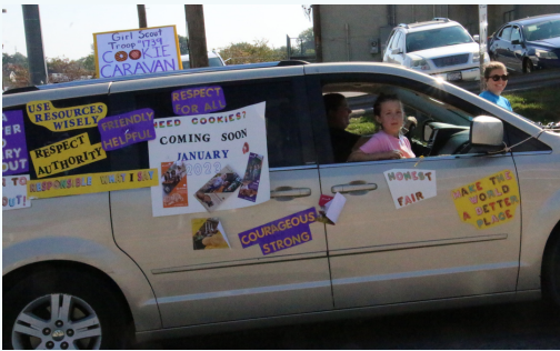
Judges Choice: Affton Daisy & Brownie Troops

The Affton Lemay Community 2022 Parade Awards: