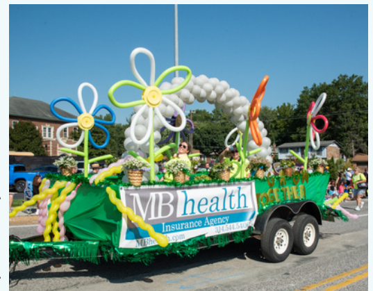
Theme of Parade-Let's Celebrate Together: MB Health Insurance Agency