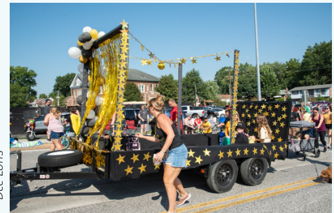
Best Church Entry: Salem Lutheran Church