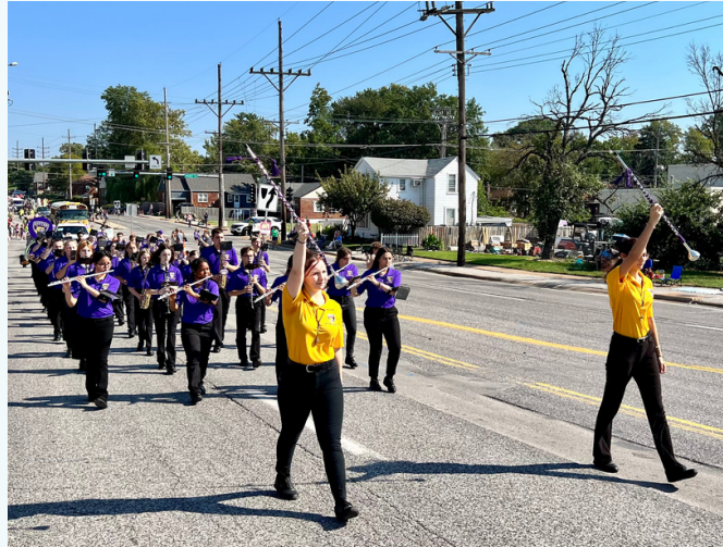
(Left) Affton band plays a song as they march down Weber road.