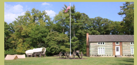
A few sights from the tour.