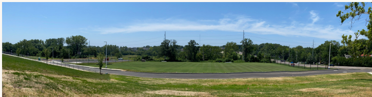
A new lower parking lot at Cor Jesu is ready for school in the fall.

Improvements are being made throughout 63123. See page 6 for an update on the Bayless athletic field that was damaged by the May rains.