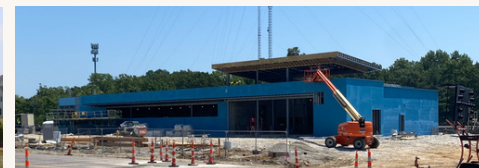
The new Affton Police precinct on Gravois is scheduled to be completed early 2024.