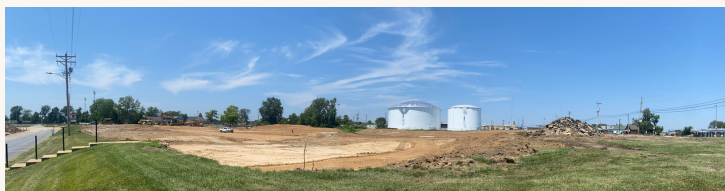
The foundation for the new Center for the Arts at Lutheran South has begun. When finished it will house a 600+ seat theater, music and art rooms.