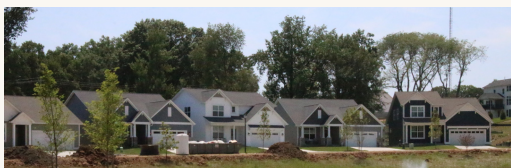
Filling up quickly is the subdivision across from Rogers Middle School on Mackenzie.