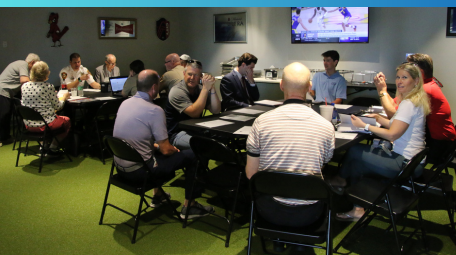
ACIA members meet at Tower Tee.

The last part of the meeting was devoted to hearing updates from the community representatives who were in attendance at the meeting.